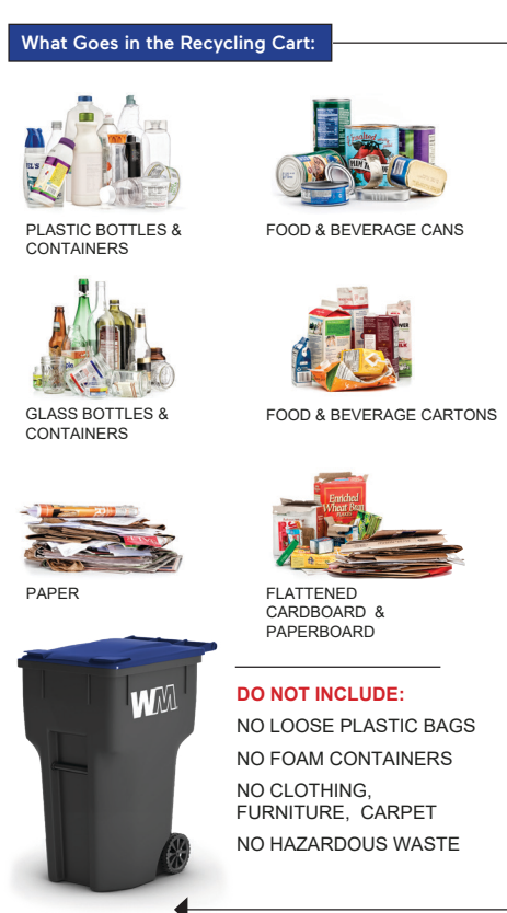
Place recyclables directly into your recycling cart - don't bag your recyclables.